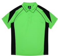
BV Umpire Shirt

*Games include in the above 5-20 are those where the Behind the Mask umpire is listed on and has signed the game sheet as an official record. It is the umpire's responsibility to make sure they are listed on and have signed the game sheet.